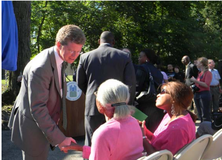
Left: HUD Secretary Donovan speaks with residents of Woodledge/Morrant Bay Apartments in Dorchester after announcement that the City of Boston is awarded $20.5 million Choice Neighborhoods Grant.